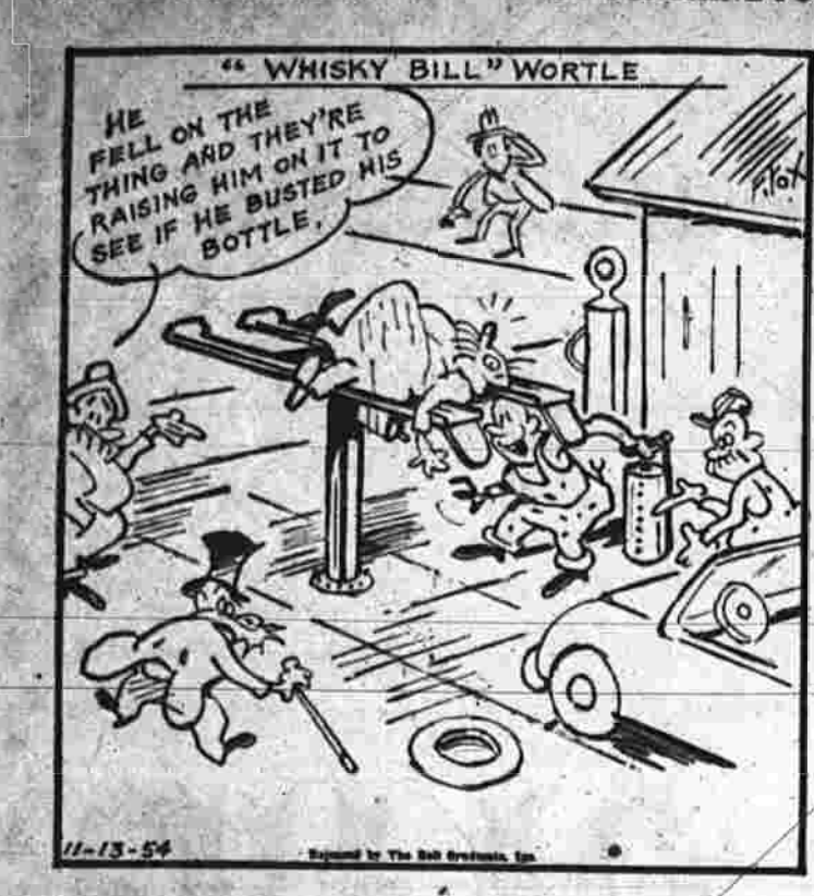
BY PONTAINE FOX