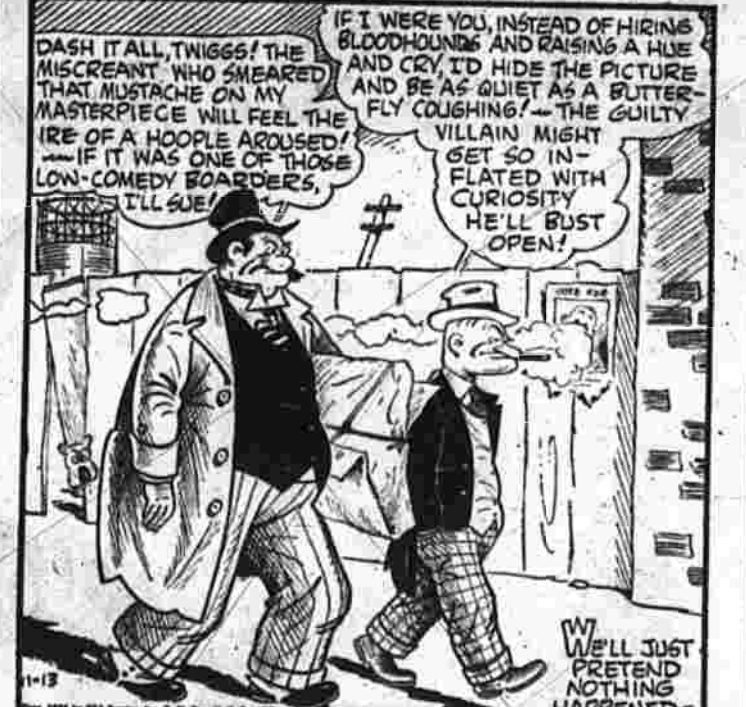
BY V. T. HAMLIN