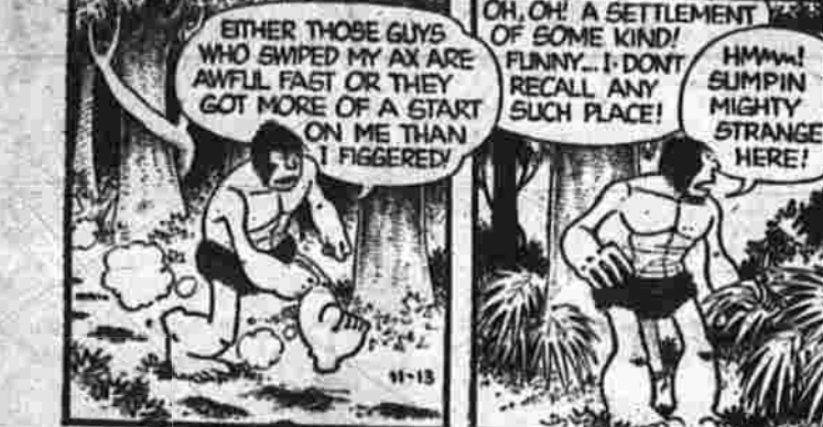
BY V. T. HAMLIN